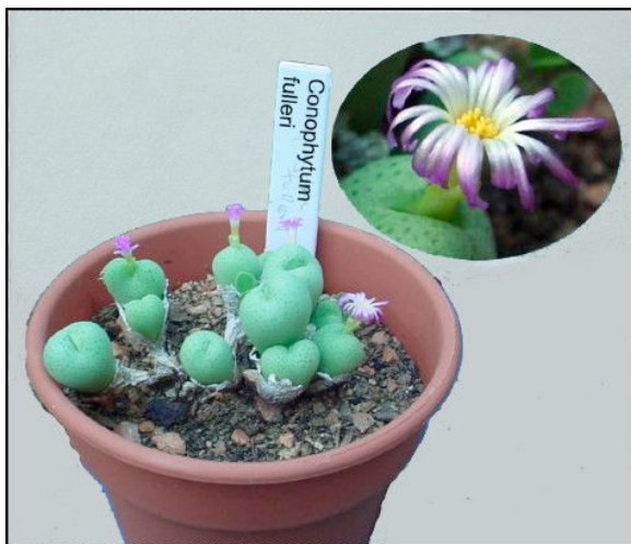
Conophytum fulleri, from South Africa

—Respectfully submitted, Edna Platte Secretary