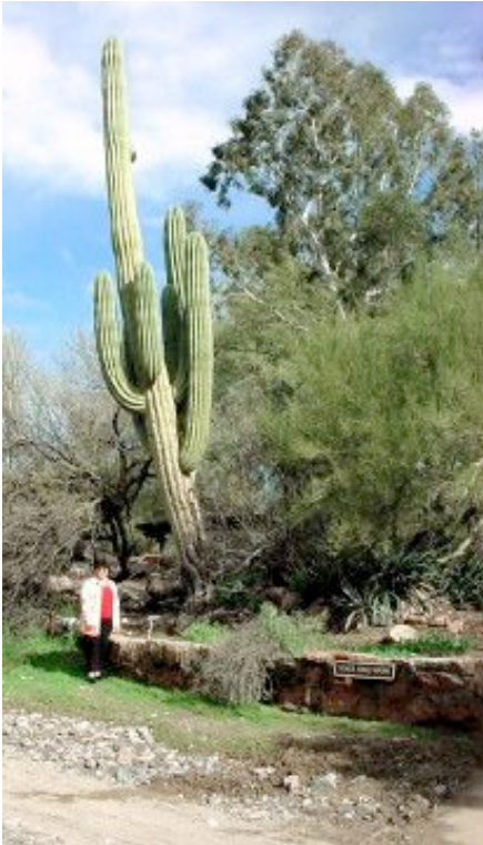
Cheryl, dwarfed by a Saguaro at Boyce-Thompson Arboretum near Superior Arizona (February 2005). You can see more at their website: arboretum.ag.arizona.edu/