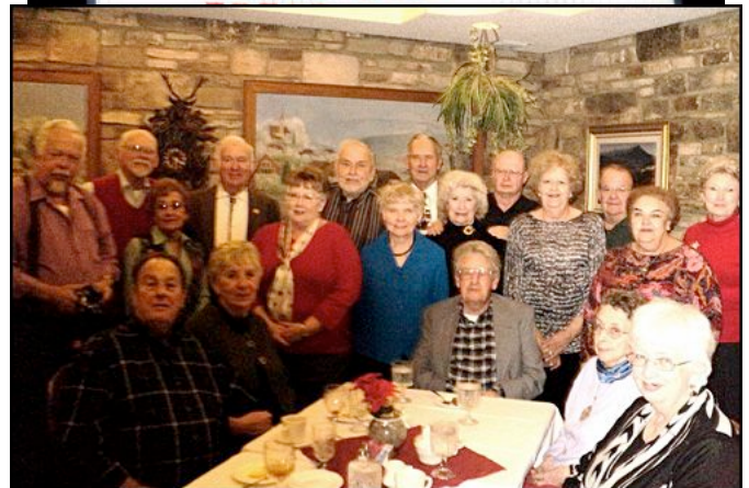
A good time was had by all at our Christmas dinner!