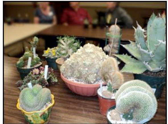
The Show-and-Tell plants at the November meeting.