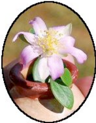
A closer look at Bobby's Pereskia weberiana (see page 2)

June 15 - 20, Austin: 35th CSSA Biennial Convention; see <www.cssainc.org> for more info coming soon.